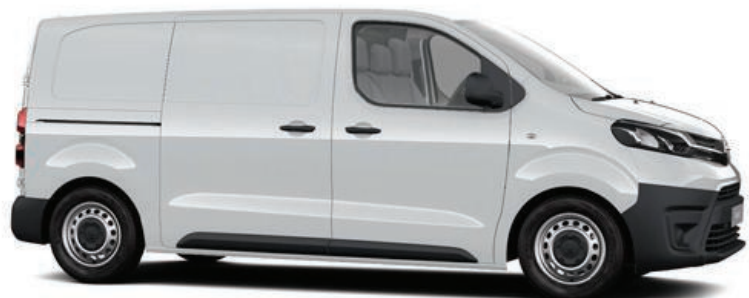
Icy White (EPR)