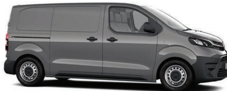
Dark Grey (EVL)