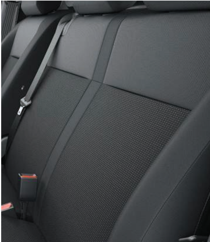
Dark grey fabric (43FT)

Available in dark grey fabric with a unified black instrument panel that delivers a fresh image.