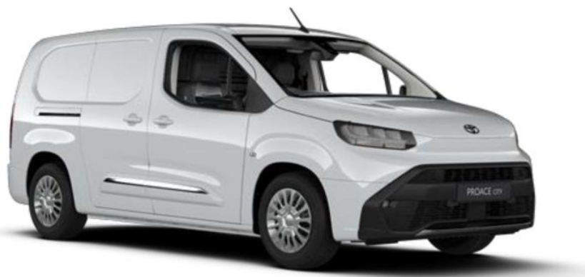
Icy White (EPR)