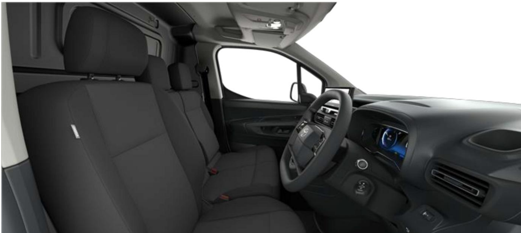
Grey fabric (CMFY)

Available in grey fabric with a unified black instrument panel that delivers a fresh image.